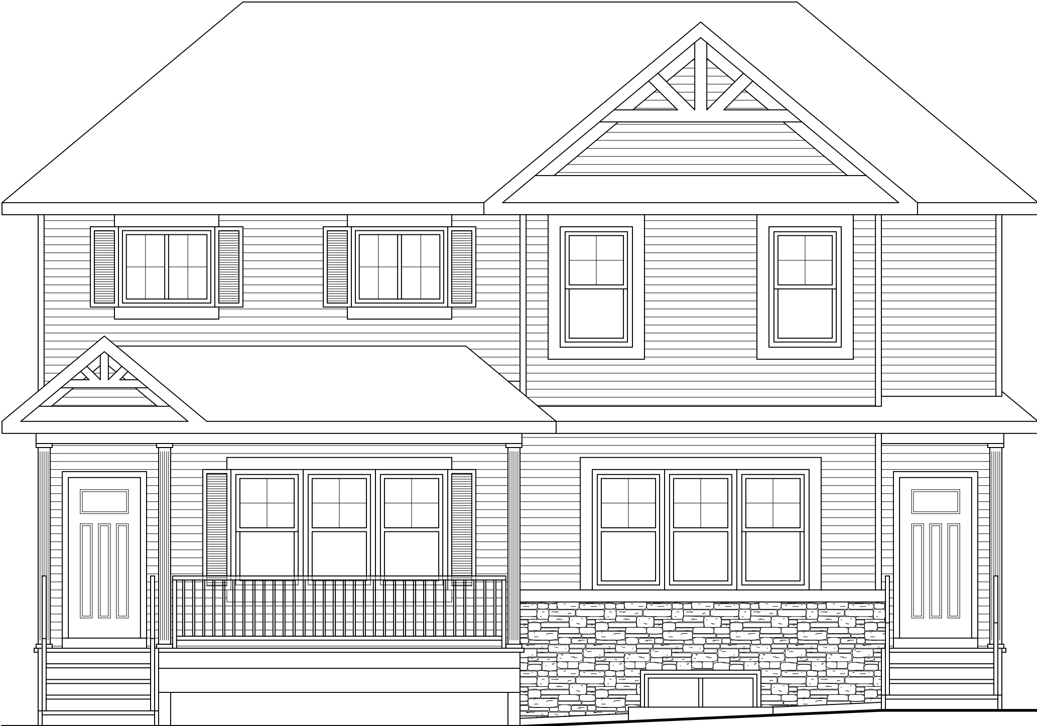
DAKOTA 1413 SQ. FT.